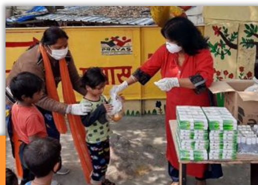
Food and hygiene kits distributed in New Delhi