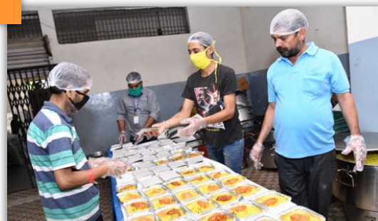
Meal kits prepared in Bhopal