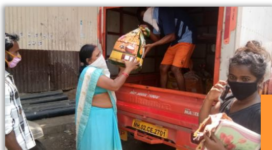
Families pick up food allowances in Mumbai