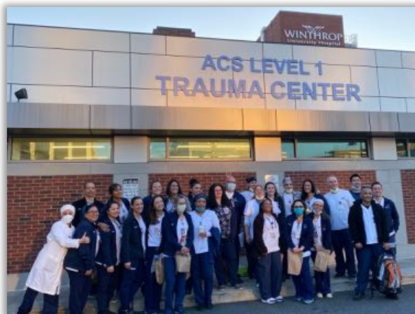
ER staff receive lunches and thank you notes