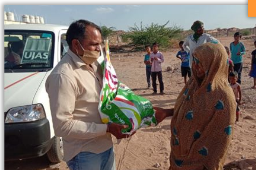
Refugee families receive food packets in Jodhpur