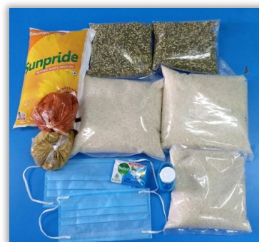
The food kit distributed in Bhuj village

Children's Hope India provided 46,529 meals to refugee families in Jodhpur with a supply of food that includes flour, oil, pulses, sugar, and other essentials. In New Delhi, we provided 28,480 meals , including oranges, biscuits, jaggery and chickpea mix, and easy-to-cook khichdi packets. Through one- to three-month food supplies, we are providing 196,225 meals to Bhopal families , in addition to immunity booster drops for students. In Mumbai, we are distributing 1,200 meals to student families that have lost their ability to work. We are also delivering 15,040 meals to families in and around Bhuj village.