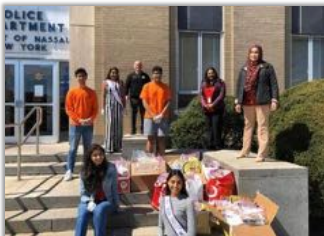
CH3 volunteers deliver lunch to police station